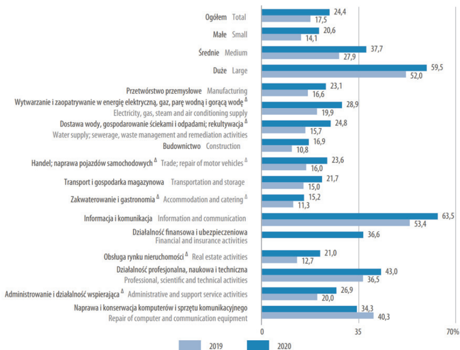
Fig. 1. The use of paid cloud computing services by enterprises

Compared to the entire European Union, Poland is in the pre penultimate place in the use of paid cloud-based solutions (see fig. 2). The average in the European Union is 24%, and Finland can boast the highest percentage of the use of paid cloud solutions (65%).