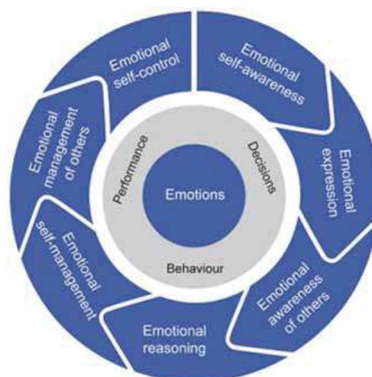
Fig. 1. Link between emotional intelligence and job satisfaction